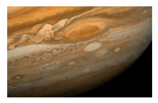
FIG. 3 The Great Red Spot, an anti-cyclonic vortex in the upper atmosphere of Jupiter. It has existed at least since it was observed in 1610 by Galileo Galilei with one of the first telescopes and measures 14,000 \ km north-south and 40,000 \ km east-west. Similar large-scale, long-lived vortices exist in the atmospheres of the other gas giant planets of our solar system. Features of "small-scale" turbulence can be clearly seen in the picture.