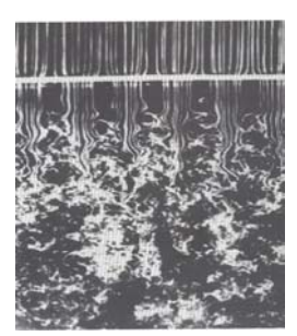
(b) Grid turbulence