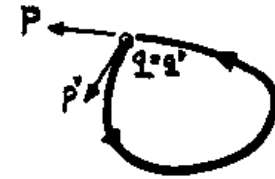
Figure 33.1: A returning trajectory in the configuration space. The orbit is periodic in the full phase space only if the initial and the final momenta of a returning trajectory coincide as well.